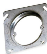
PLASTER (MUD) RING