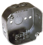
4" OCTAGONAL BOX