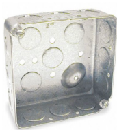
4" SQ. OUTLET BOX