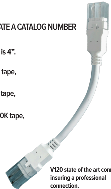
V120 state of the art connectors insuring a professional connection.

Example: To order a 48'-8" length of 4000K tape, specify: V120-SHO-40-48-8